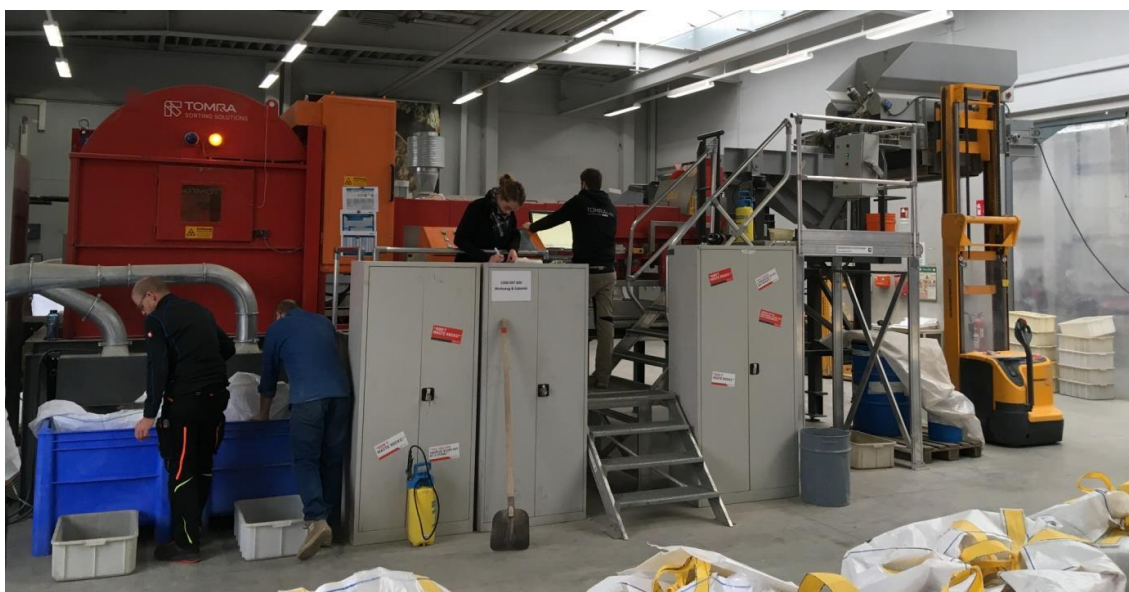
Figure 4: XRT sorter: 3D model of XRT sorter (top) and XRT sorter test rig in Tomra's technical center

Compared to the laser sorting the XRT sorting was significantly less selective. This is indicated by the reduced recovery in the rougher stage. Therefore the laser sorting technology appears to be the preferred solution for sorting of the ore from the Wolfsberg project.