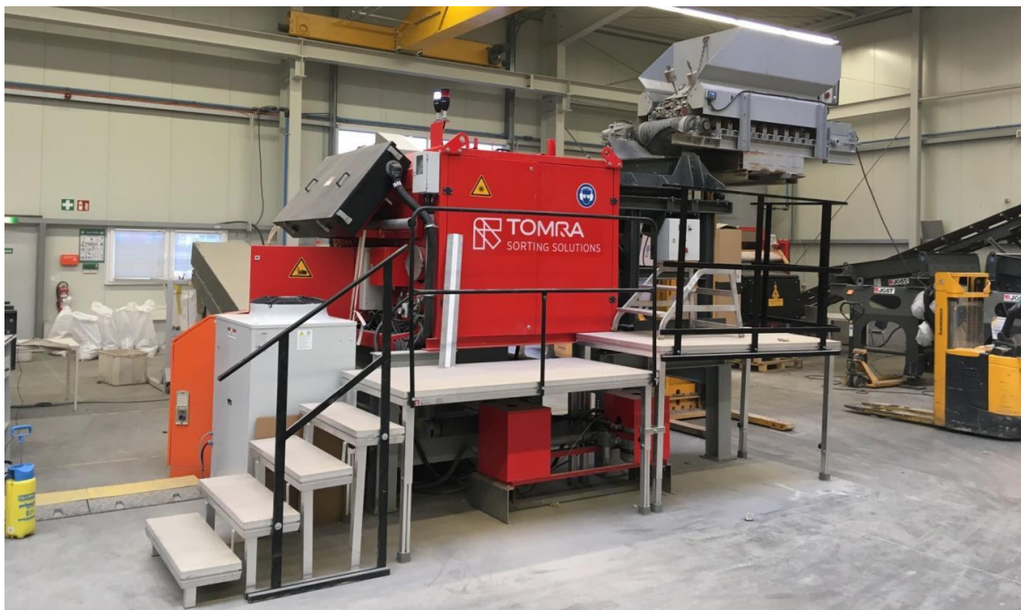
Figure 3: Laser sorter: 3D model of Laser sorter (top) and Laser sorter test rig in Tomra's technical center used for fraction +25 mm

Based on the results of initial screening and laser sorting tests an overall mass balance for both the mica schist (MHP) ore and the amphibolite (AHP) ore sample was estimated. In case of AHP ore a lithium recovery of 93.1 wt.-% in sorted AHP ore was calculated. The sorted ore is the combined product after sorting of fraction +25 mm and fraction +8 -25 mm as well as fines - 8 mm from the initial screening step. In addition spodumene is pre-concentrated and lithium content increased from 1.0 wt.-% to 1.3 wt.-% Li 2 O after sorting. In the case of MHP ore the Lithium content increased from 0.9 wt.-% to 1.1 wt.-% Li 2 O after sorting. The results are comparable to the previous sorting results, where 92.0 wt.-% overall lithium recovery for MHP and 93.0 wt.-% for AHP were achieved.