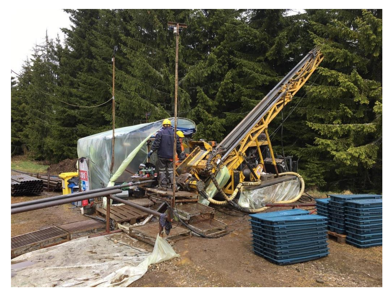
Figure 1: Drill Rig I - in operation

mapping of the drill core, as well as assays at the Company's external lab in Ireland. All data have been collected into a common database to update the geological block-model to upgrade and increase JORC compliant resource as anticipated. The block model update is in progress and is expected to be reported in Q4/2021.