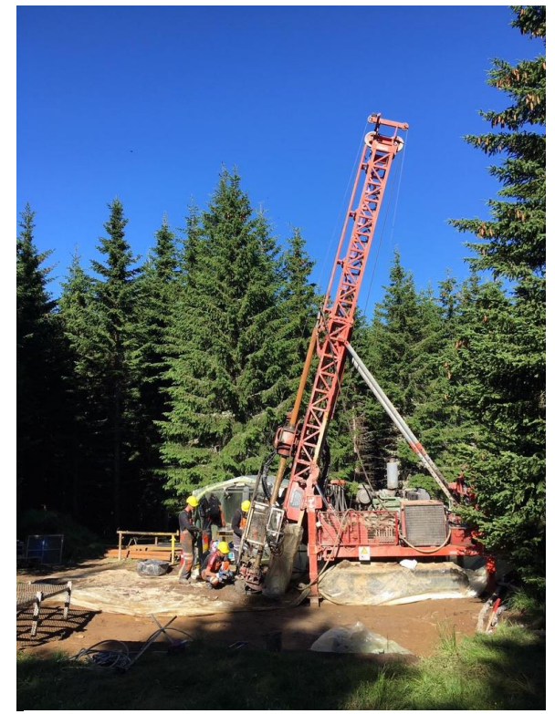
Figure 2: Drill Rig II - in operation

The Company has worked with their DFS-team, based in Europe, South Africa and Canada covering geology, mining and scheduling, ore concentration and metallurgy with conversion as well as structural design work, marketing, financial planning and scheduling covering future CAPEX and OPEX for the operations. The final team for the aforementioned areas of expertise has been nominated and DRA Global was nominated as the leading contractor to manage the DFS on behalf of the Company.