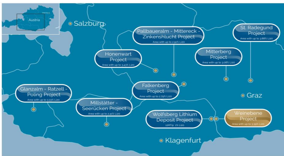
Figure 4 – Weinebene Lithium Project Location

EVR holds an 80% interest in Subsidiary Jadar Lithium GmbH ( Jadar Lithium ), the holder of the Weinebene and Eastern Alps Projects which lies 20km to the east of the Company's Wolfsberg Project (refer figure 4).