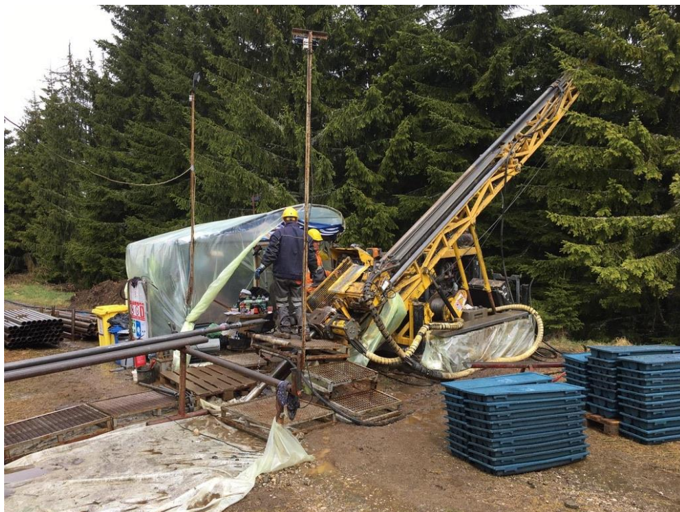
Figure 1 – Drill rig 1 in operation

On 16 August 2021 the Company announced that during the drilling campaign an intersection of 1.91m pegmatite mineralisation @ 2.4% of Li 2 O content was recovered, an exciting result given the average grade of the deposit is 1.0% Li 2 O.