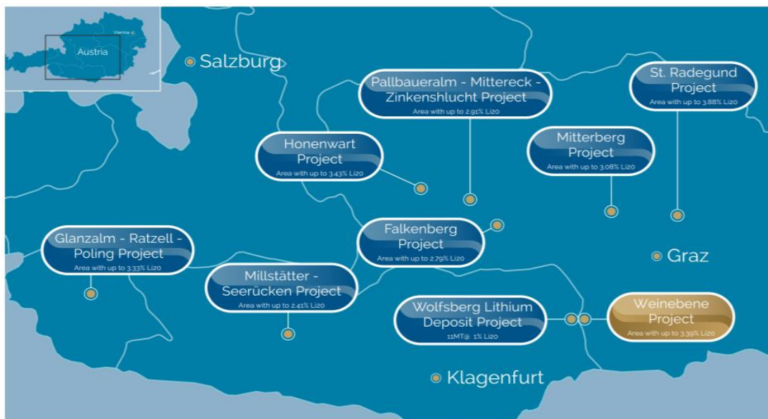
Figure 1 – Weinebene Lithium Project Location

EVR holds an 80% interest in Subsidiary EV Resources GmbH (previously Jadar Lithium GmbH), the holder of the Weinebene and Eastern Alps Projects which lies 20km to the east of the Company's Wolfsberg Project (refer figure 1).